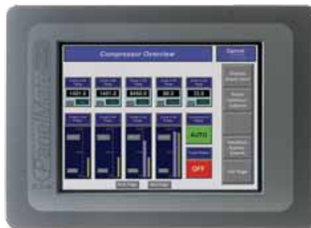
ePro PS: 8.4" to 15" and Blind Node Windows XP Embedded

Three hardware families—one software package