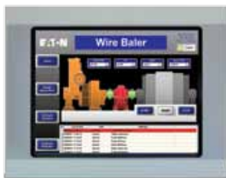
XP: 8.4" to 15" and Blind Node Windows XP Embedded